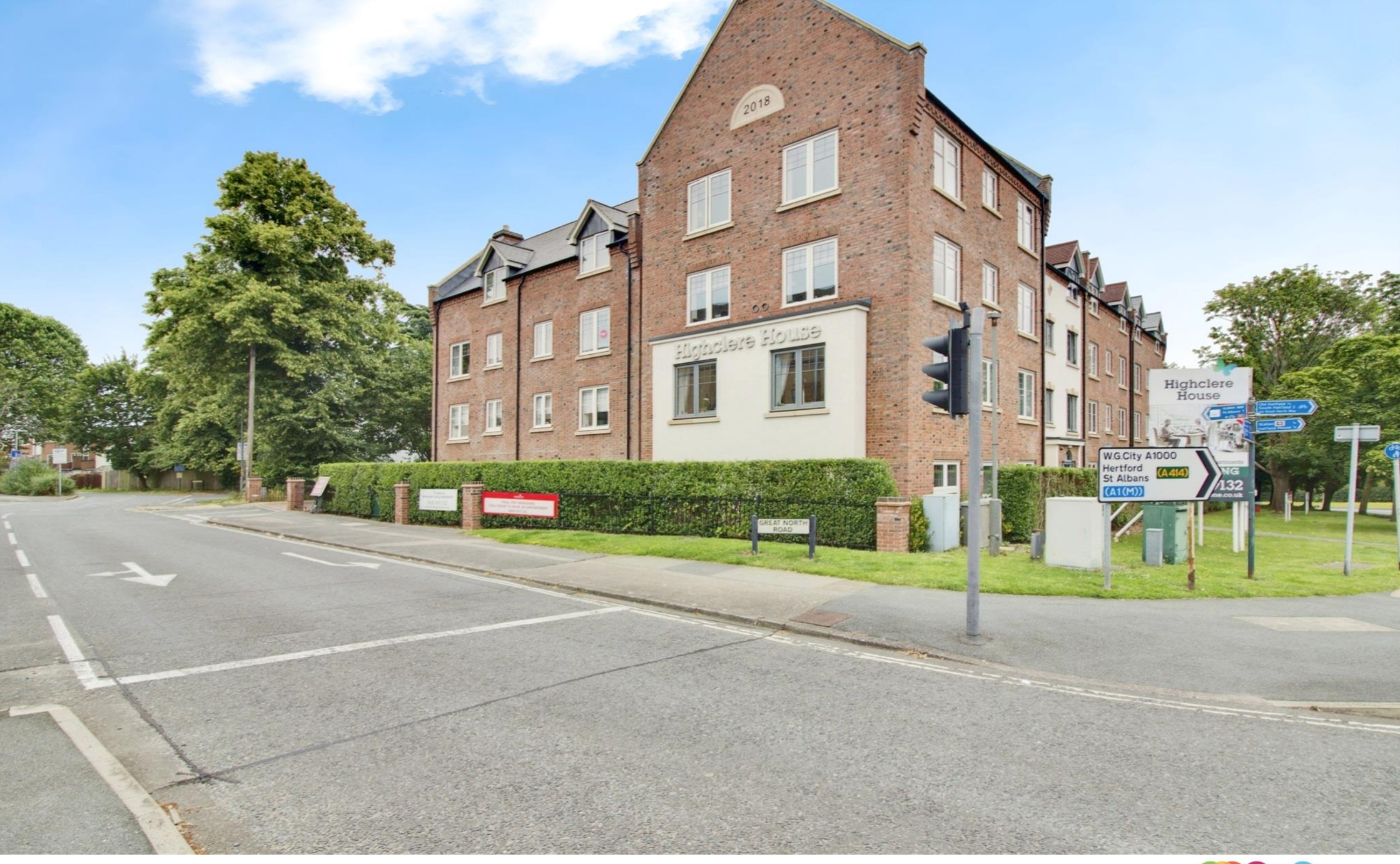
Highclere House Great North Road, Hatfield AL9 5DB