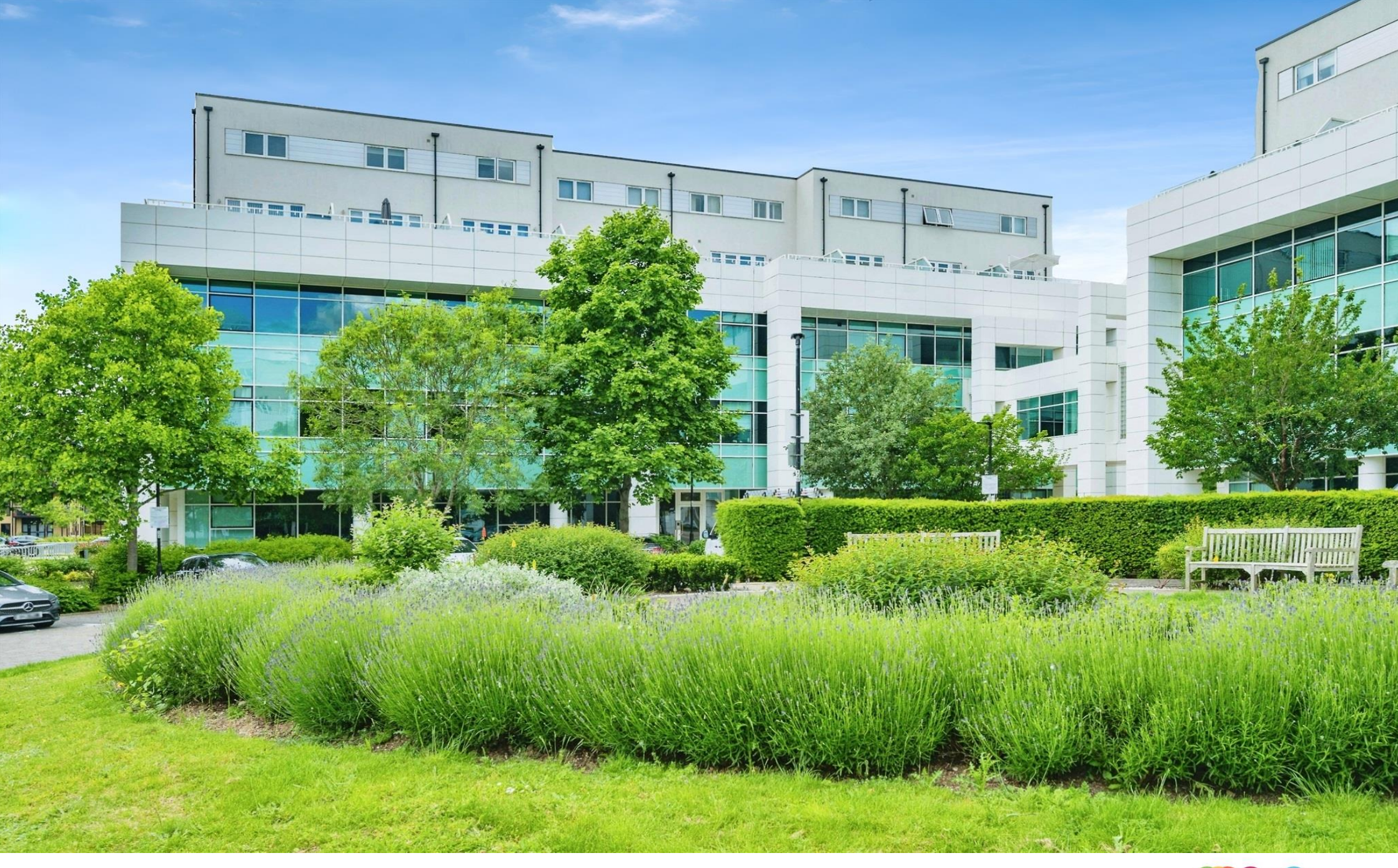
Chrysler House Bessemer Road, Welwyn Garden City AL7 1GS