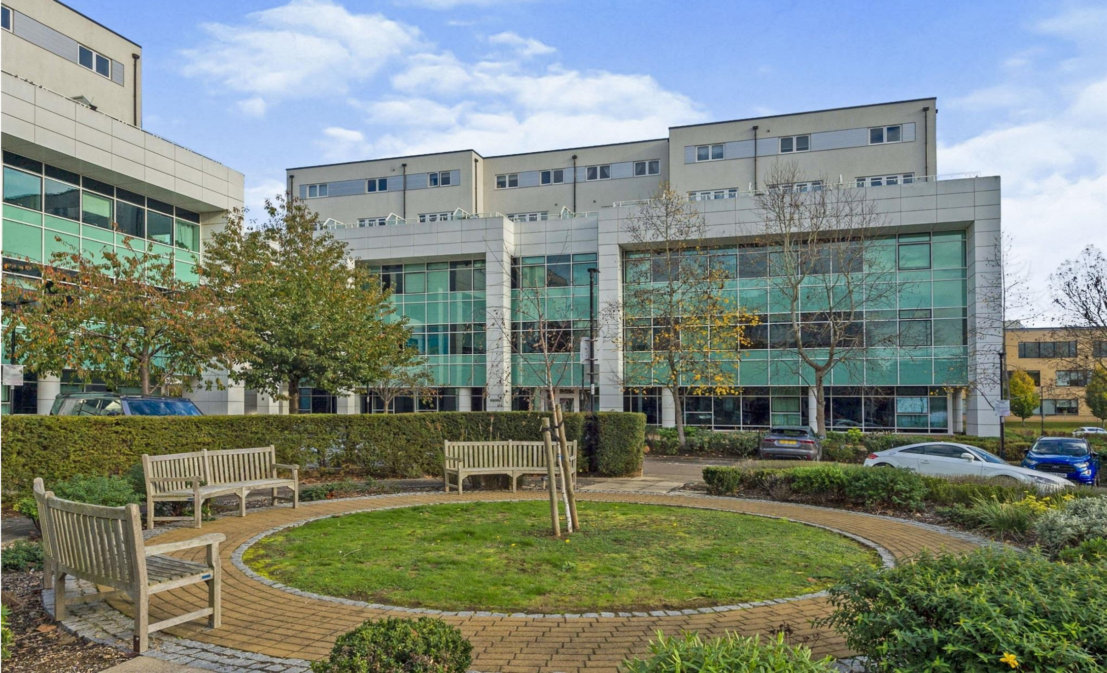
Liberty House Bessemer Road, Welwyn Garden City AL7 1FU