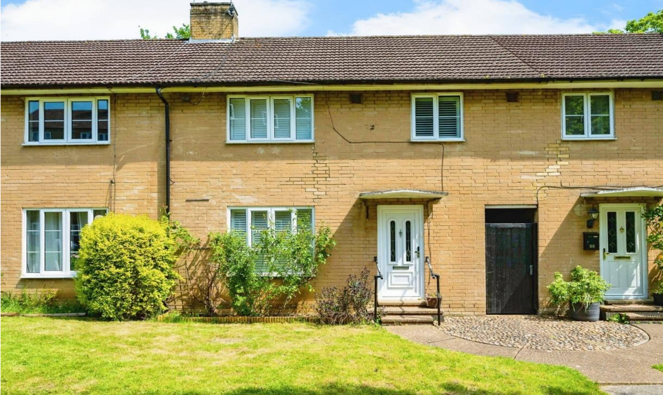
Sweet Briar, Welwyn Garden City AL7 3DU