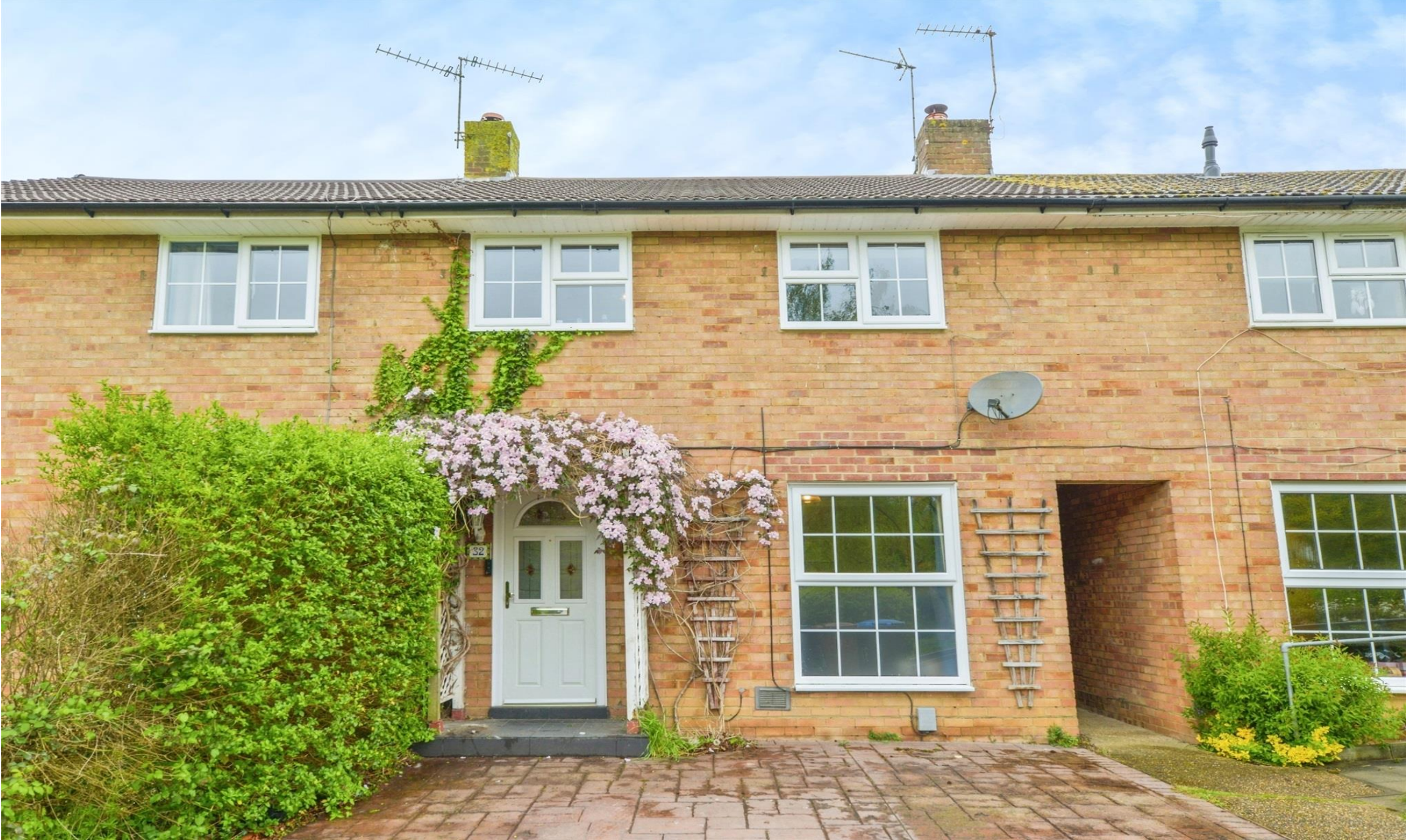
The Commons, WELWYN GARDEN CITY AL7 4RP