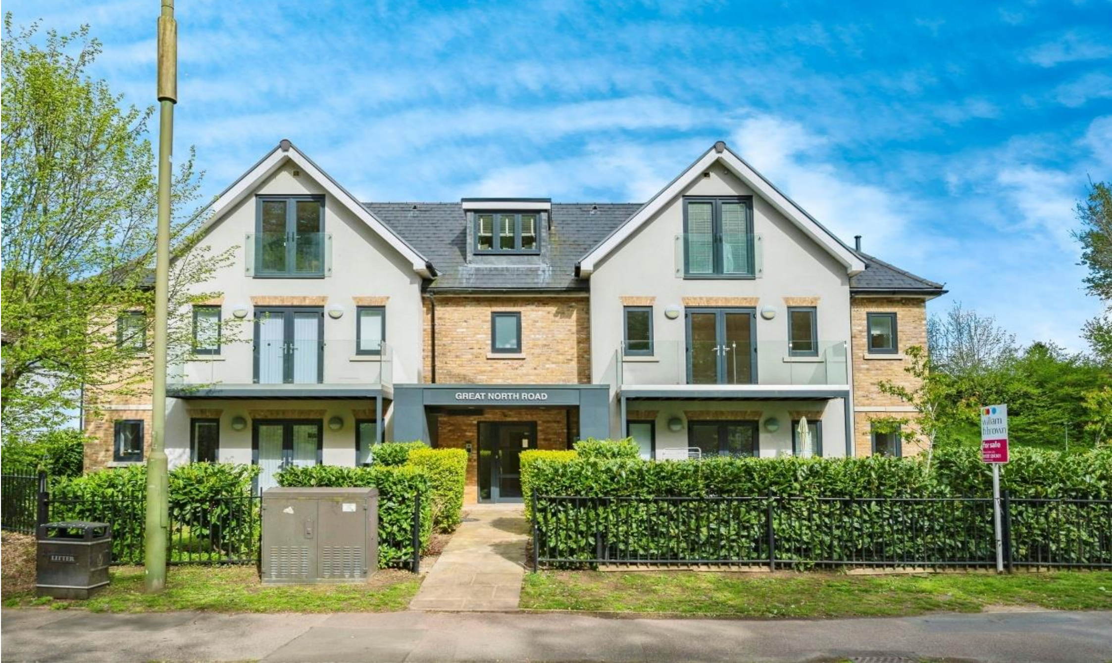
Great North Road, Welwyn AL6 0TA