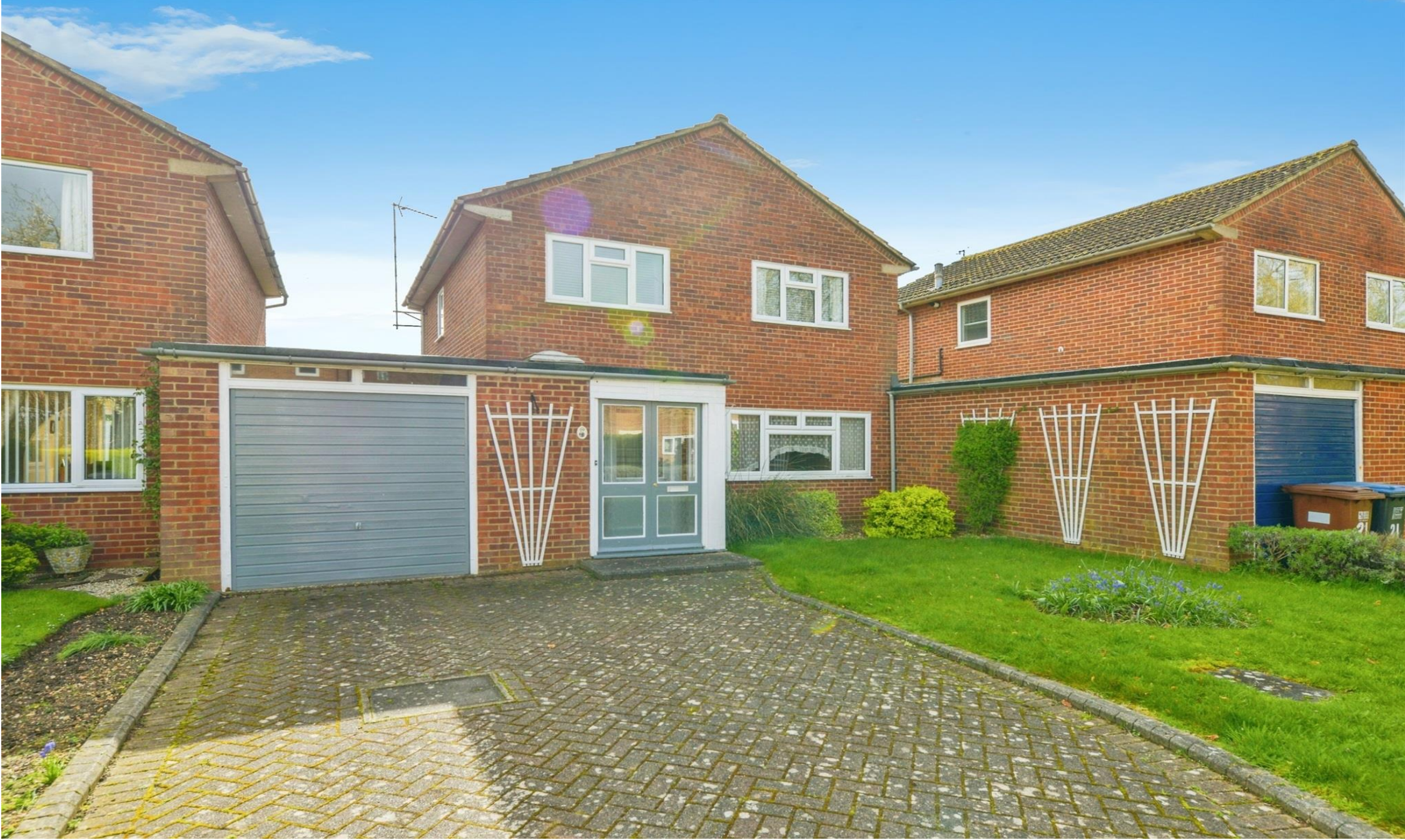
Long Ley, Welwyn Garden City AL7 2HE