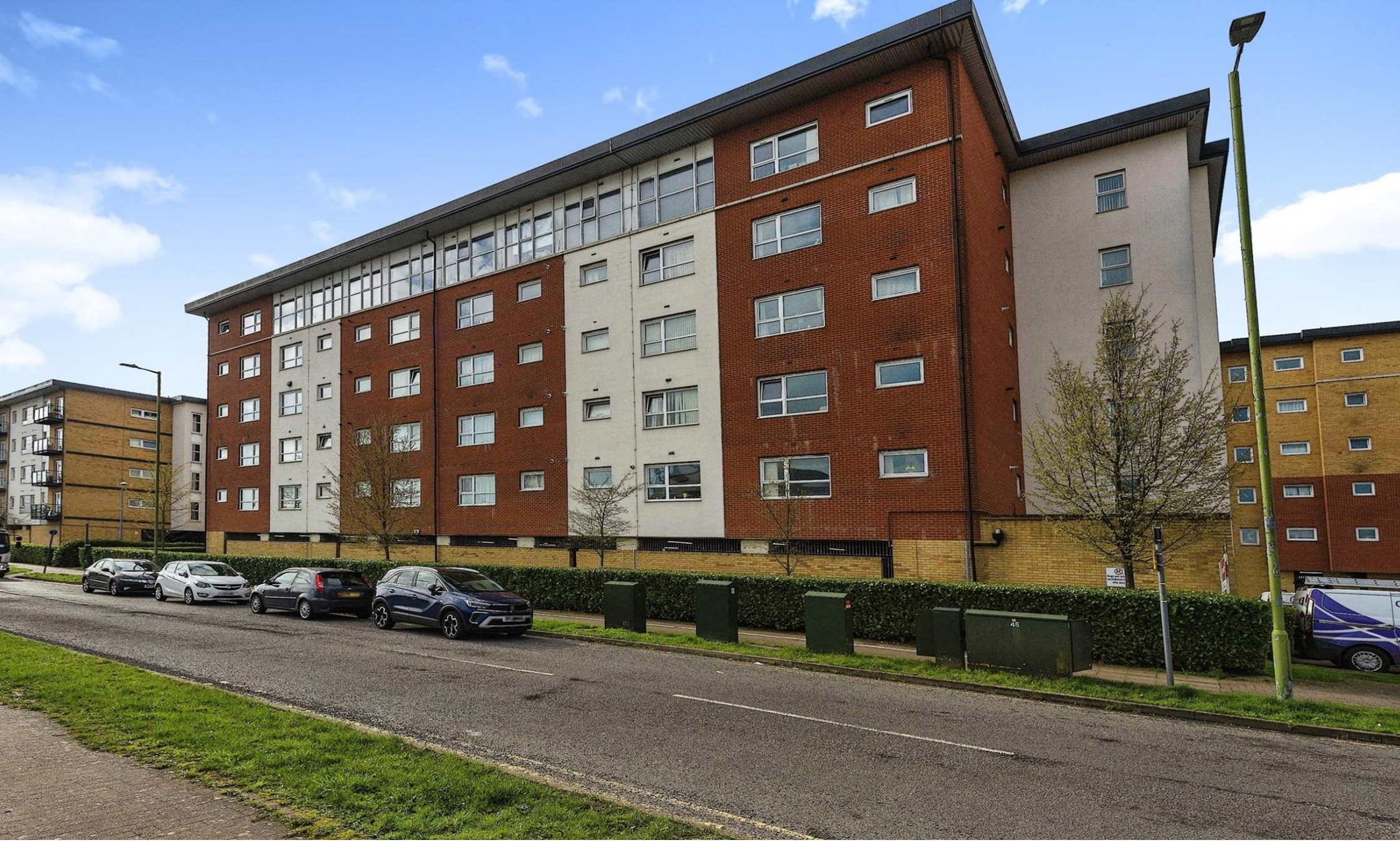
Clarkson Court, Hatfield AL10 9GT