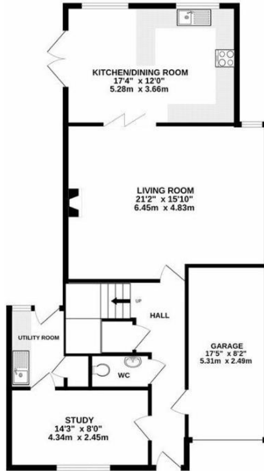
GROUND FLOOR 983 sq.ft. (91.4 sq.m.) approx.

Tiled flooring, W/C, wash hand basin, bath, shower head, radiator.