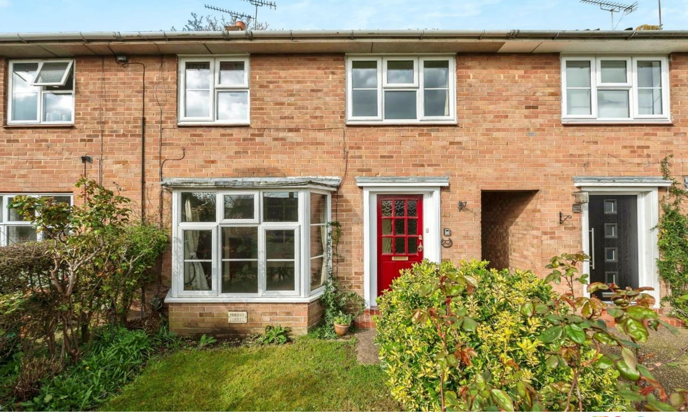
Knightsfield, WELWYN GARDEN CITY AL8 7RA