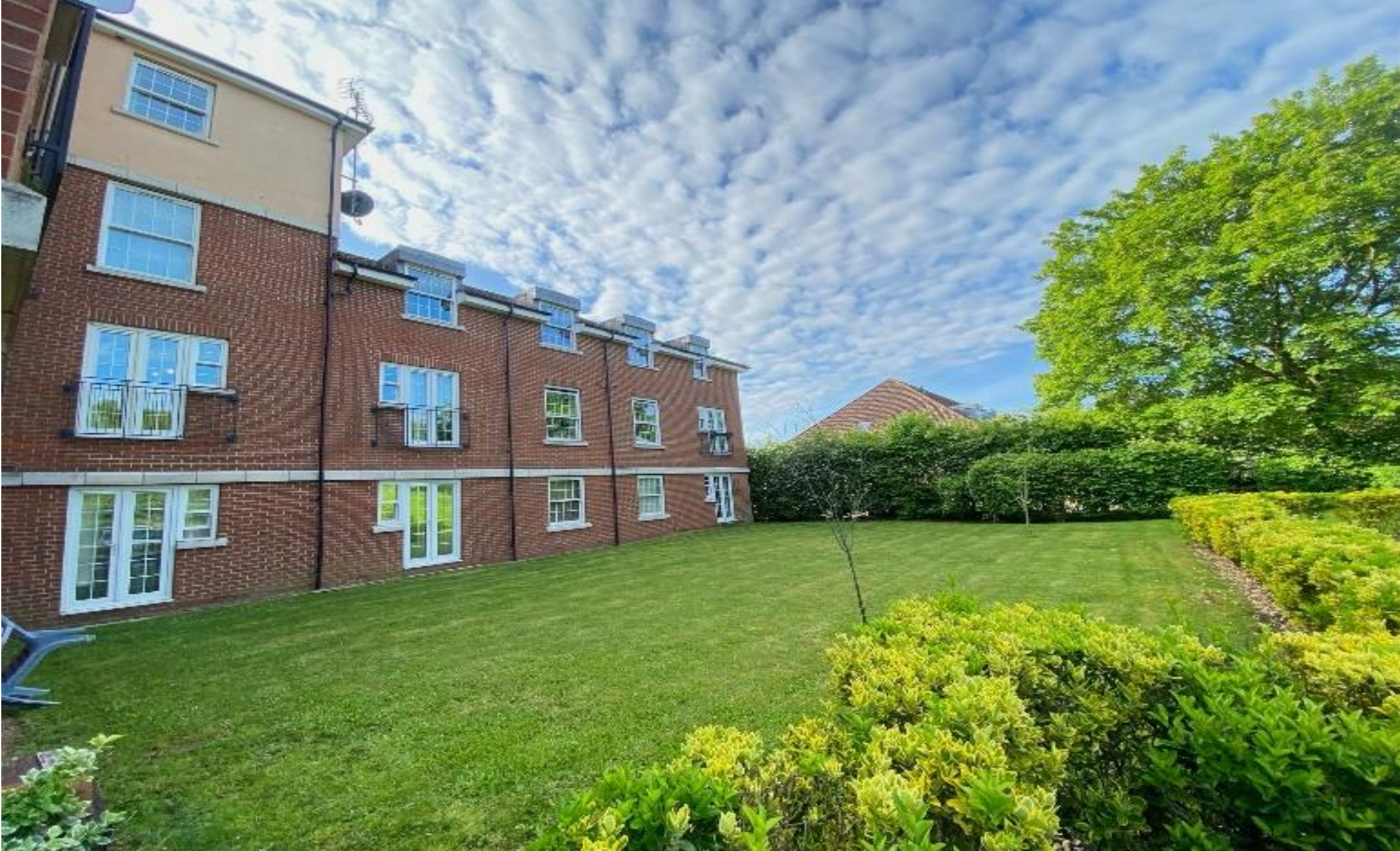
Merrifield Court, Welwyn Garden City AL7 4SH