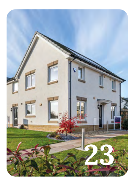
Take your next step