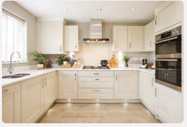
Options availability is subject to build stage of plots and options won't be available if plots have reached a certain build stage. Please contact the Sales Executive for further information.