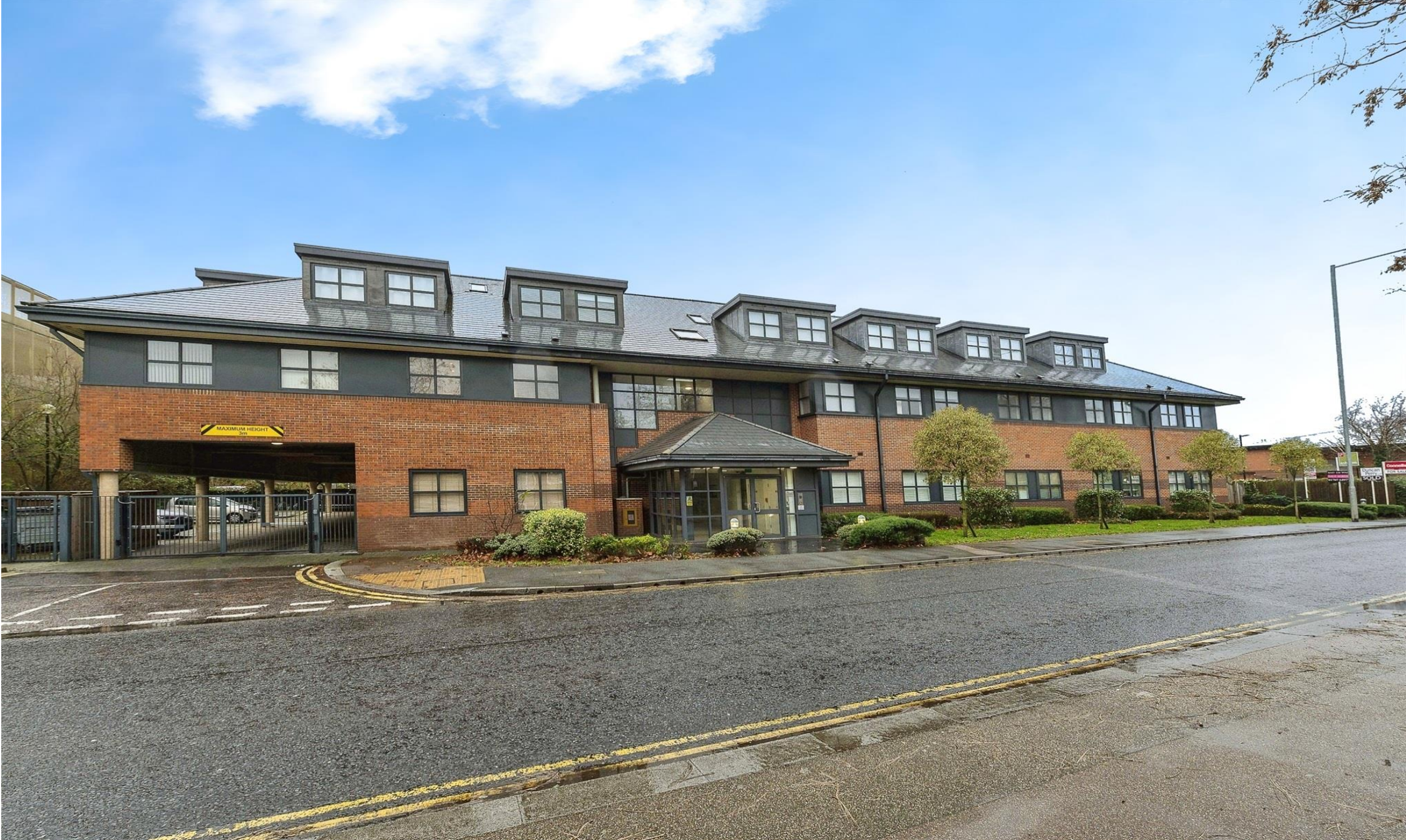
Parkgate House Great North Road, HATFIELD AL9 5FA