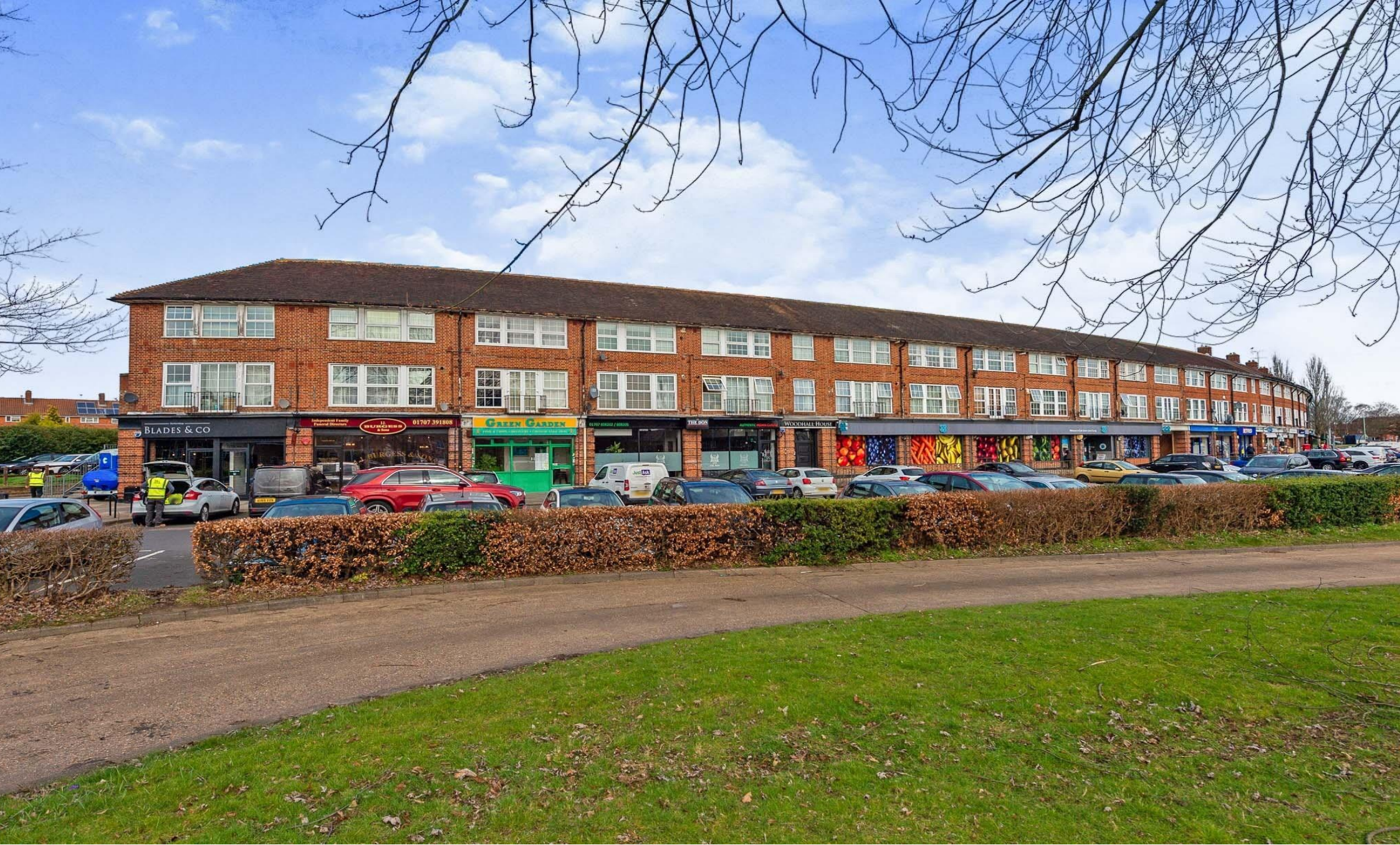
Woodhall House, Cole Green Lane, Welwyn Garden City, AL7 3PX