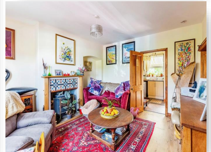
Allen Road, Finedon NN9 5EW