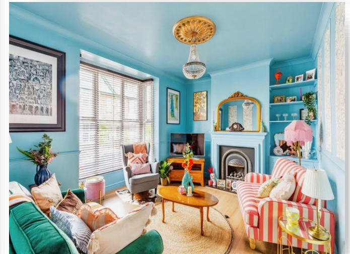
Park Road, Wellingborough NN8 4PW