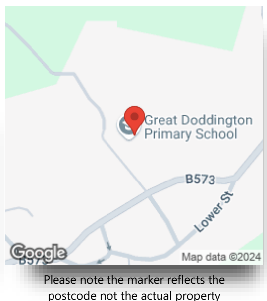
view this property online williamhbrown.co.uk/Property/WBR112240