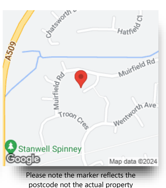
view this property online williamhbrown.co.uk/Property/WBR113154