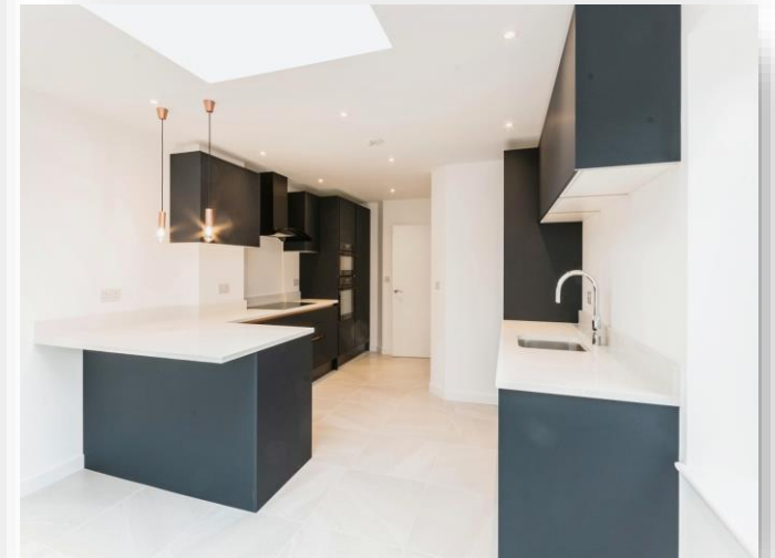
Doddington Road, Earls Barton, Northampton NN6 0NF