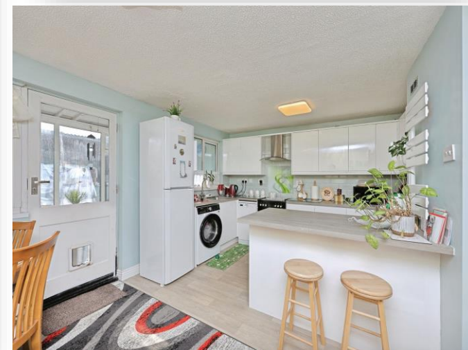
Lovell Gardens, Watton Thetford IP25 6TX