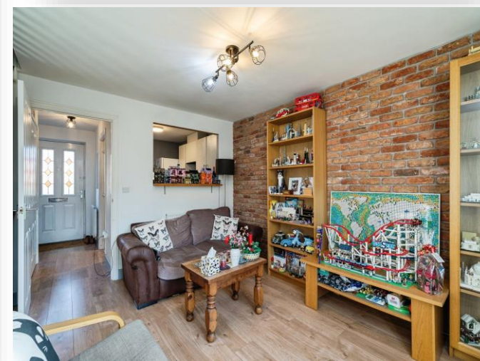
Washington Drive, Watton Thetford IP25 6GY