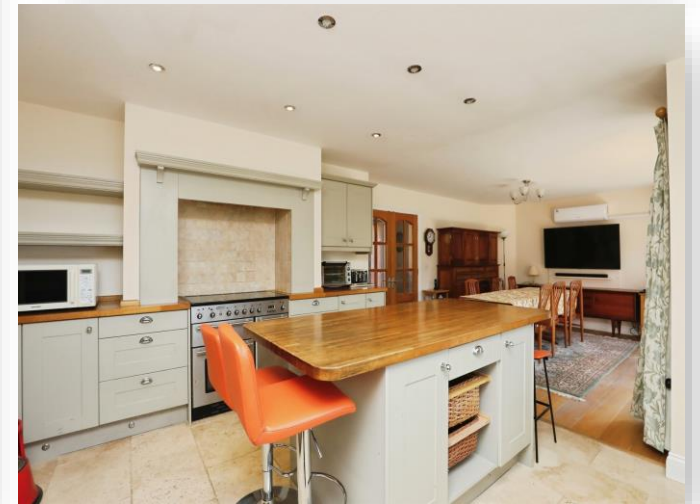
St. Marys Close, Watton Thetford IP25 6DS