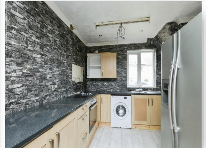
Cardington Road, Watton Thetford IP25 6JR