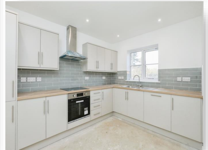
Church Road, Griston Thetford IP25 6QA