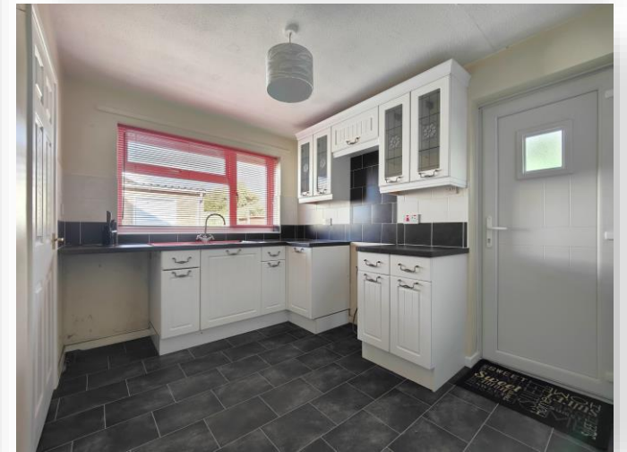
Wayland Avenue, Watton Thetford IP25 6LD