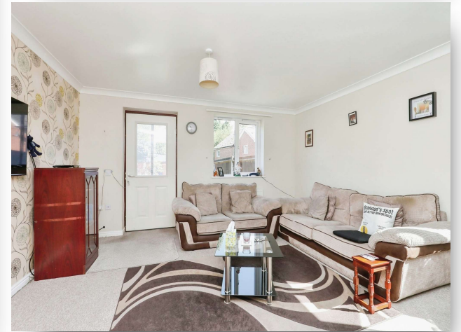
Akrotiri Square, Watton Thetford IP25 6HY