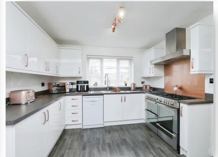
Cressingham Road, Ashill, Thetford, IP25 7DG