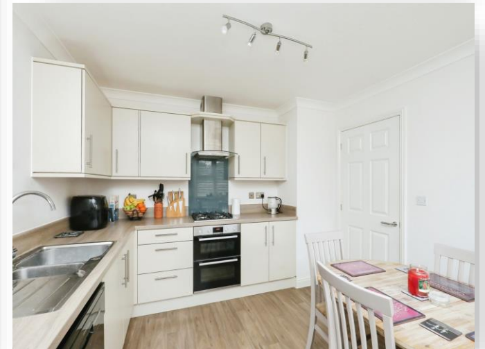
Eastern Road, Watton Thetford IP25 6PA