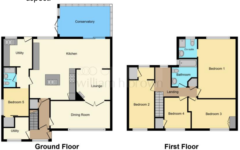
This floor plan is for illustrative purposes only. It is not drawn to scale. Any measurements, floor areas (including any total floor area), openings and orientation are approximate. No details are guaranteed, they cannot be relied upon for any purpose and they do not form part of any agreement. No liability is taken for any error, omission or misstatement. A party must rely upon its own inspection(s). Powered by www.focalagent.com

Tiled suite comprising low level w.c, hand wash basin, double shower, heated towel rail, tiled flooring, UPVC double glazed obscured window to rear aspect.