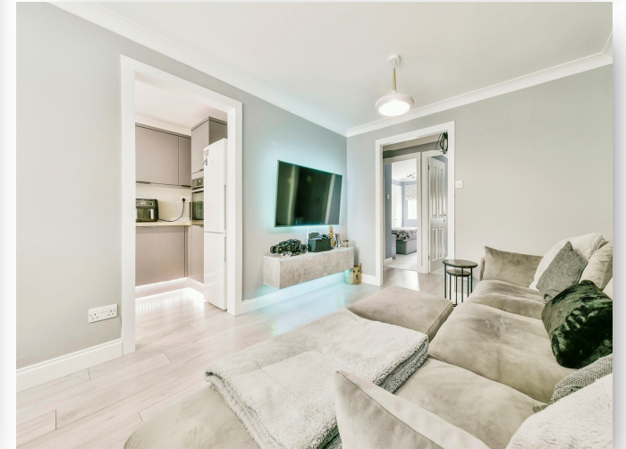
Kestrel Court, Ware SG12 0XQ