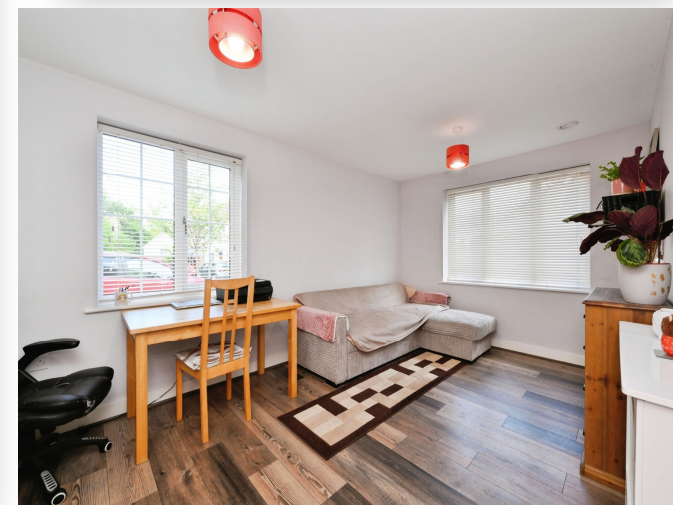
Clements Close, Puckeridge Ware SG11 1DE