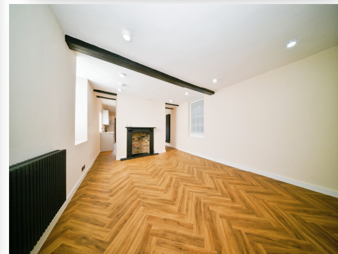
Baldock Street, Ware SG12 9DH