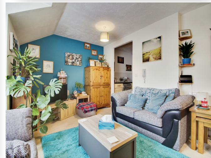
The Granary, Stanstead Abbotts Ware SG12 8XH