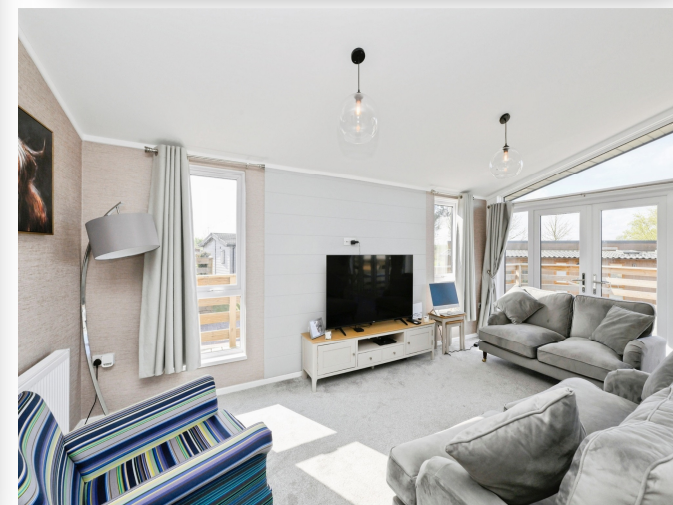
The Fairways Great Hadham Road, Much Hadham SG10 6JE