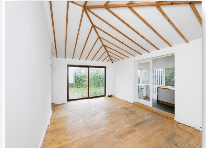
Chestnut Place Hadham Cross, Much Hadham SG10 6AL