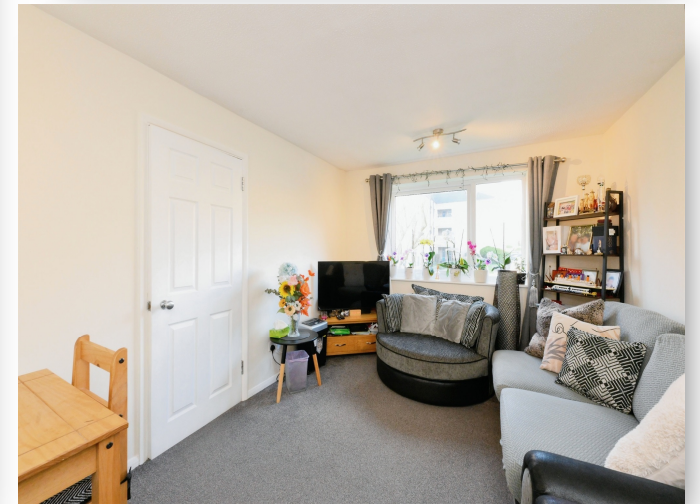
Falcon Court, Ware SG12 0XB