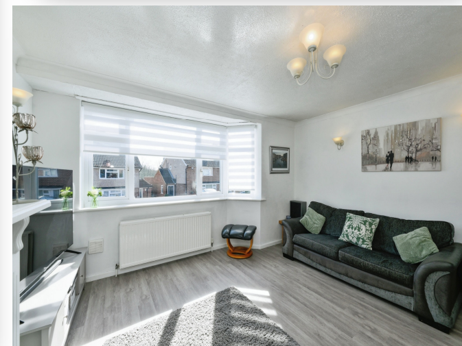
Milton Road, Ware SG12 0QD