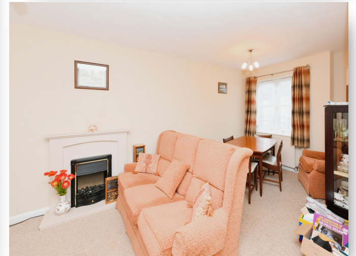
Yorkes Mews, Ware SG12 9DB