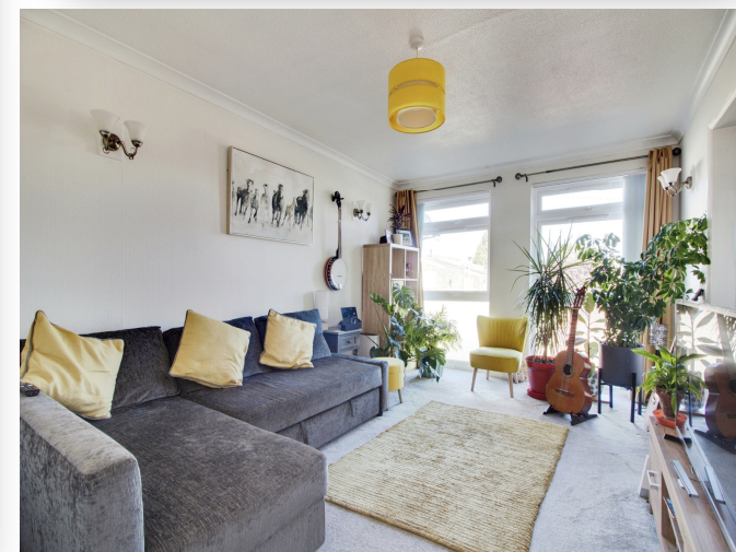
Station Road, Puckeridge Ware SG11 1SN