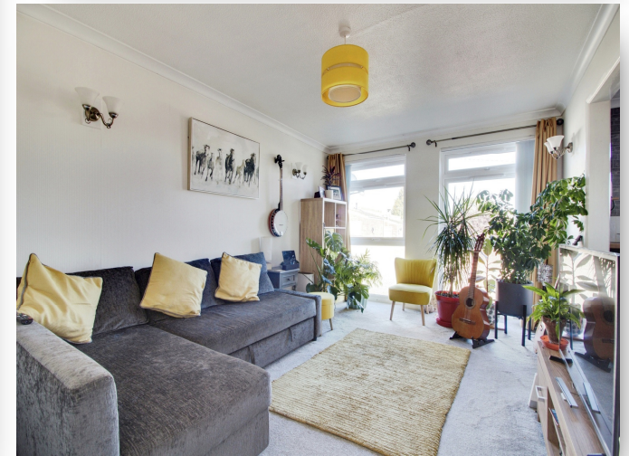
Station Road, Puckeridge Ware SG11 1SN