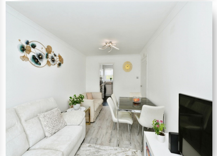
Wickhams Wharf, WARE SG12 9PT