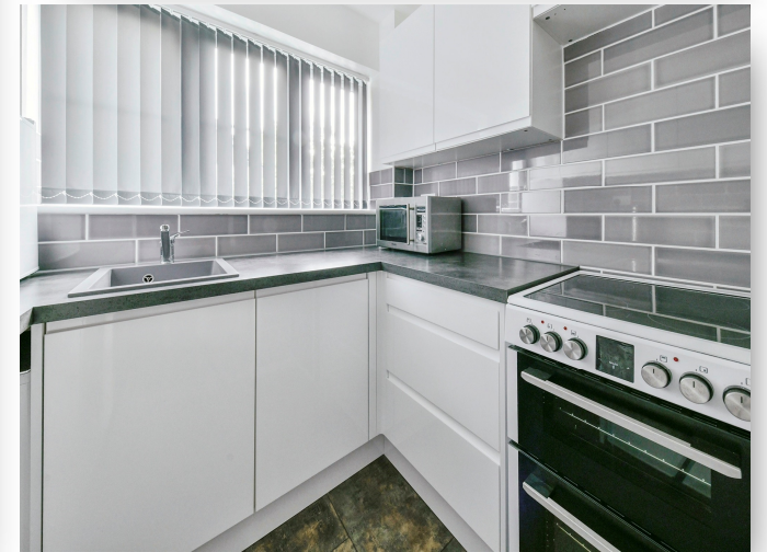
Larksfield, Ware SG12 7NS