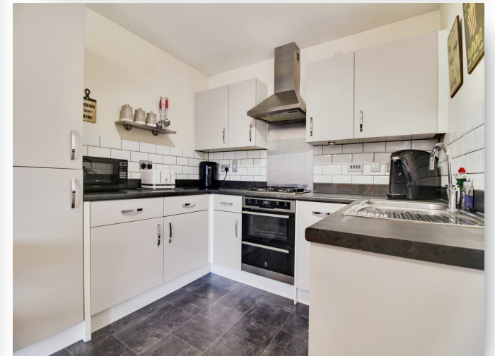
Railway View, Ware SG12 9JR