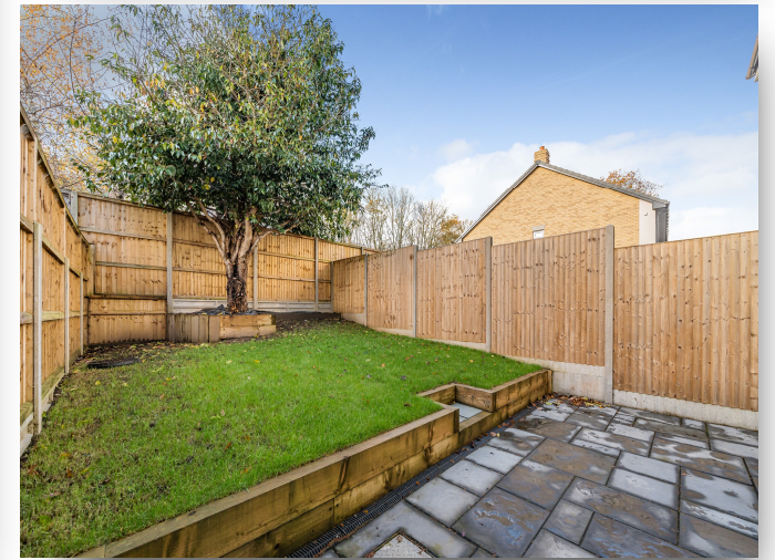
Plot 1, Sovereign Place, Puckeridge Ware SG11 1RT