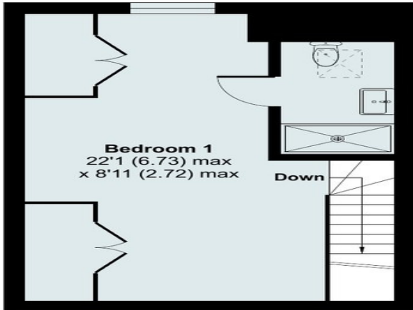
SECOND FLOOR- 336 sq ft / 31.2 sq m