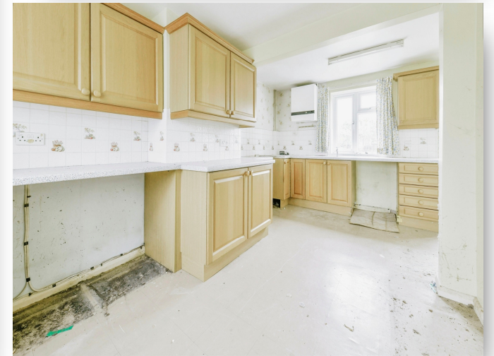
Cambridge Road Cottage, Ware SG11 1BA