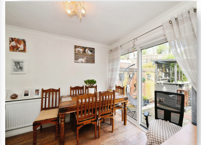
Chapelfields, Stanstead Abbotts Ware SG12 8HT