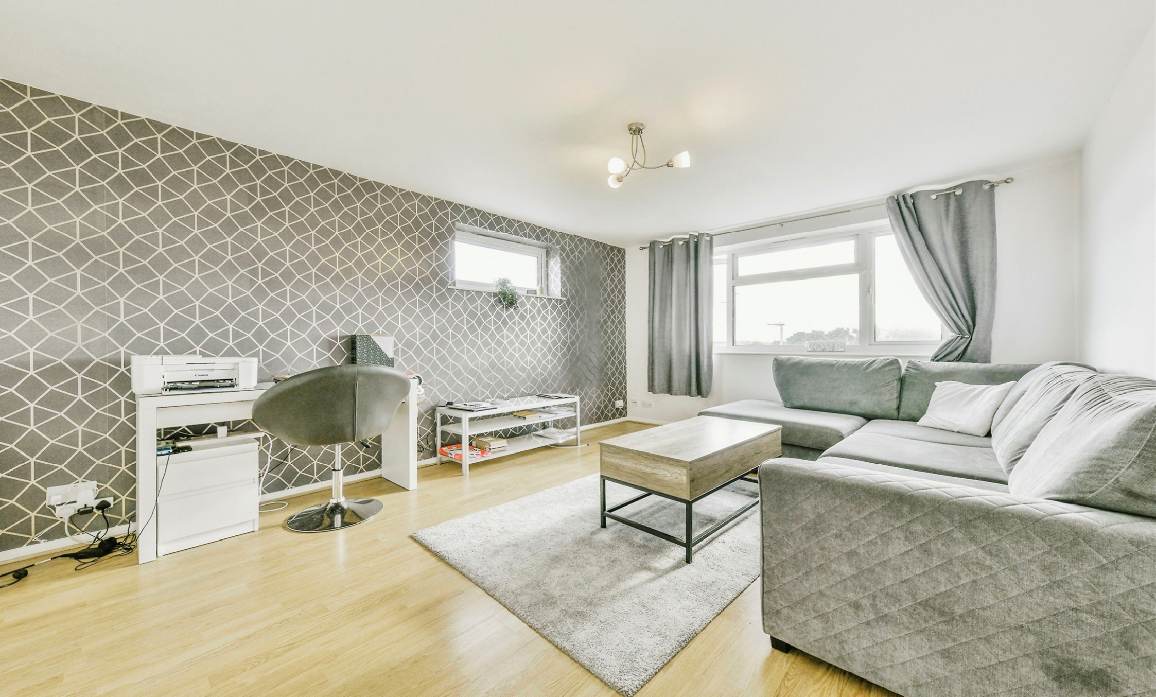
Gauldie Way, Standon Ware SG11 1QD