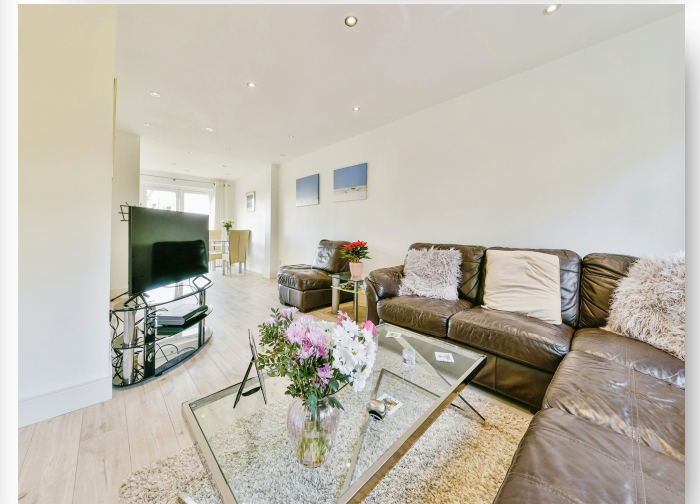
Chapelfields, Stanstead Abbotts Ware SG12 8HZ