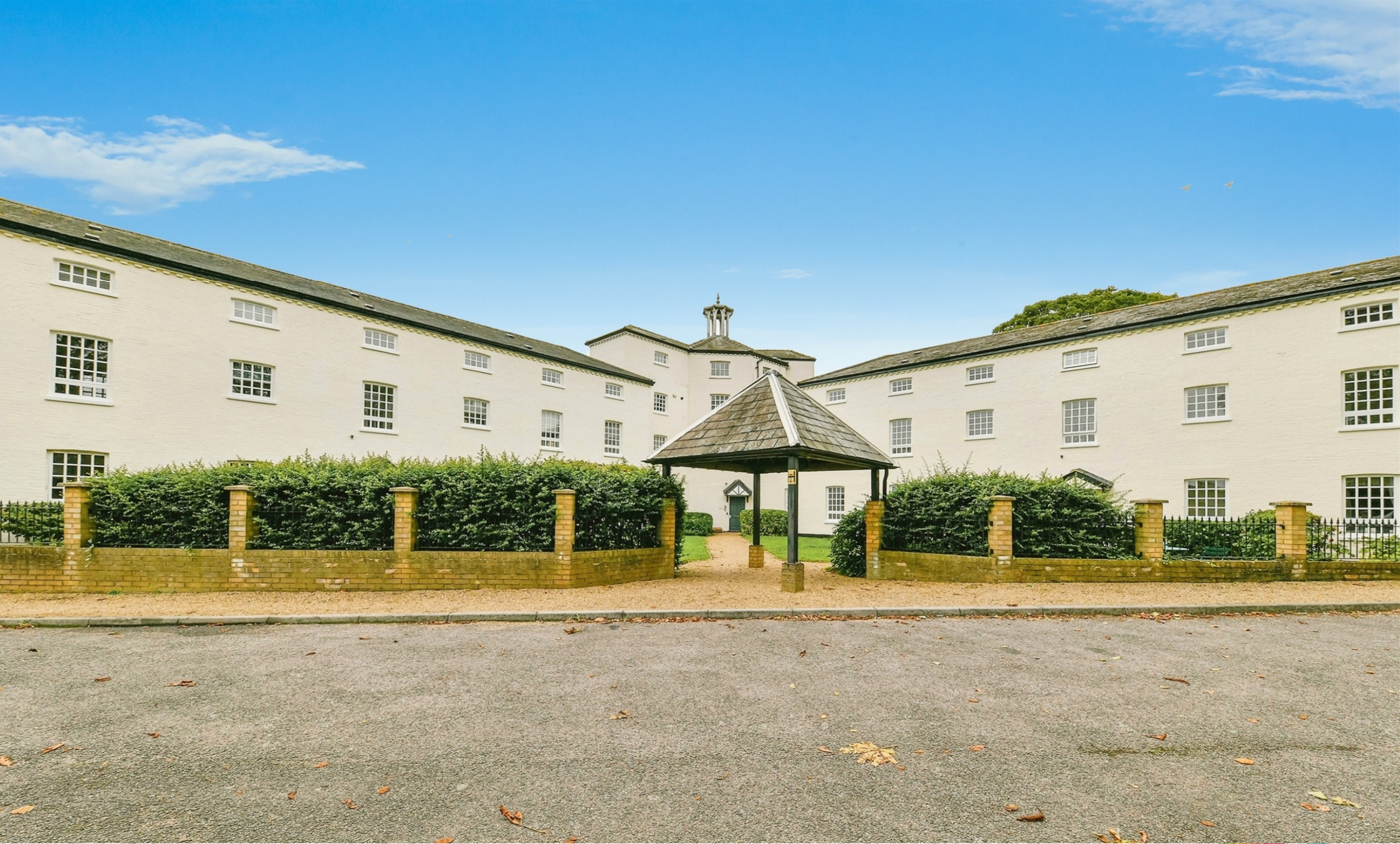
The Octagon Collett Road, Ware SG12 7LR