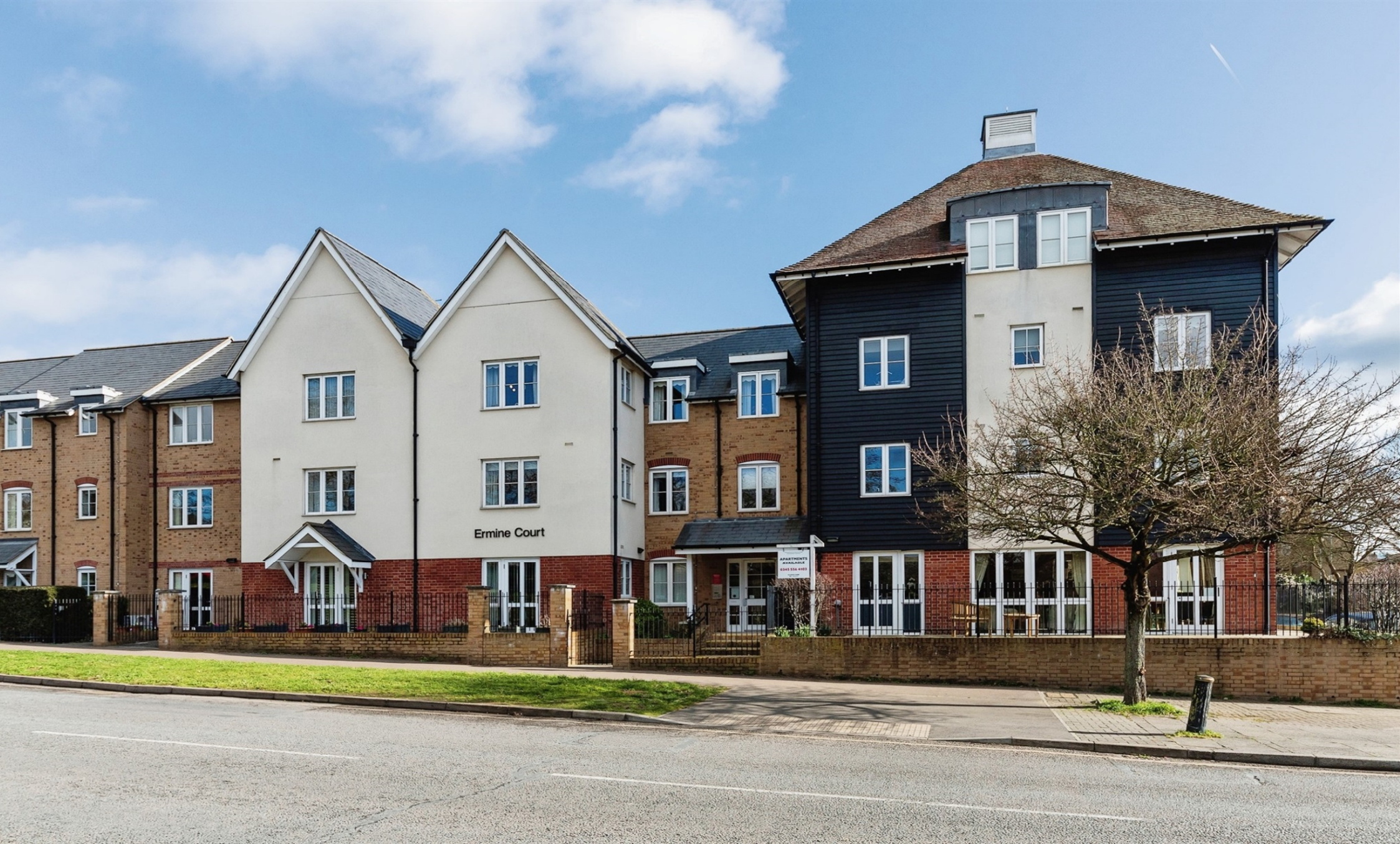
Ermine Court Coronation Road, Ware SG12 9BH